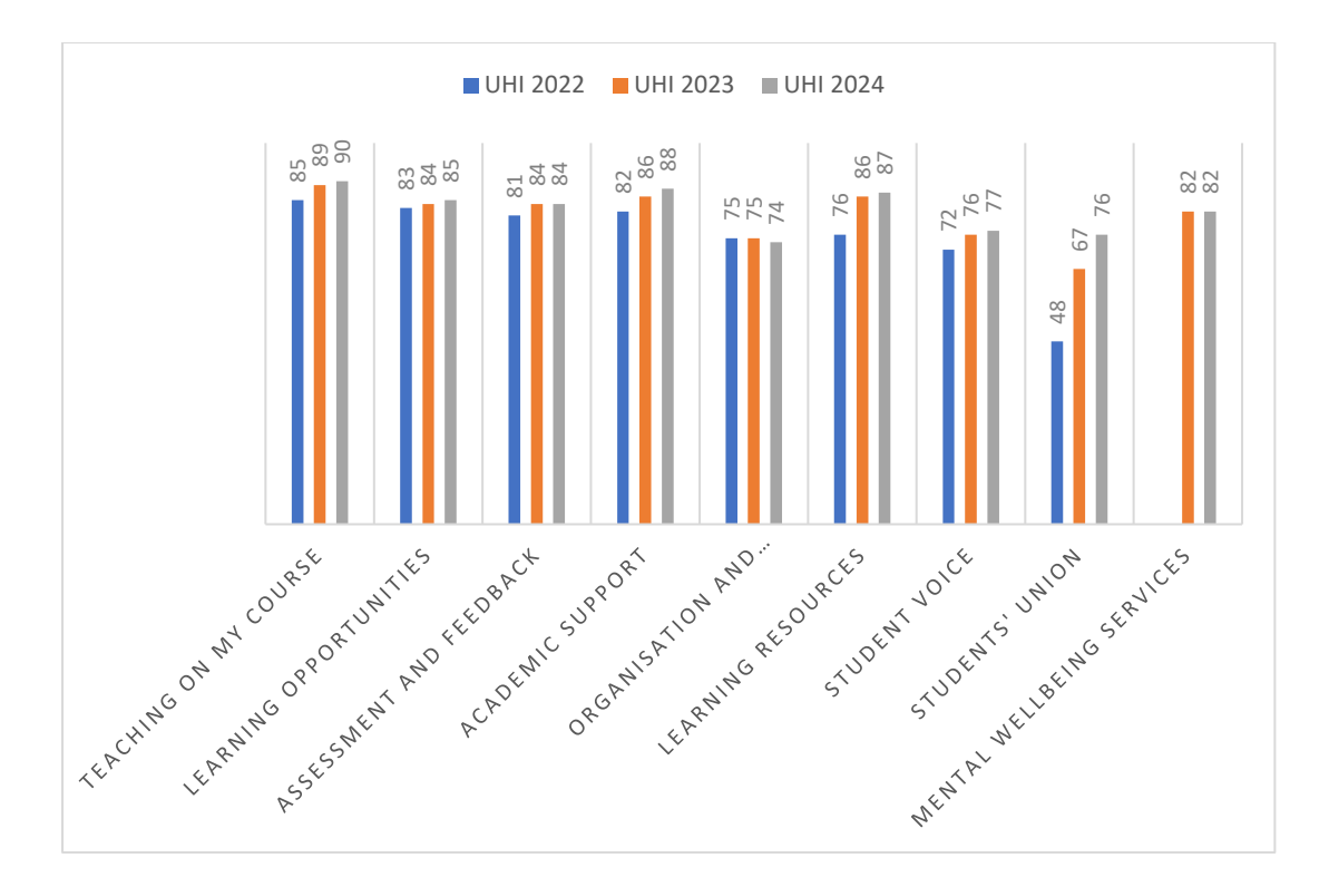
Figure 3: NSS 2024 results by question set: % agree for question set.